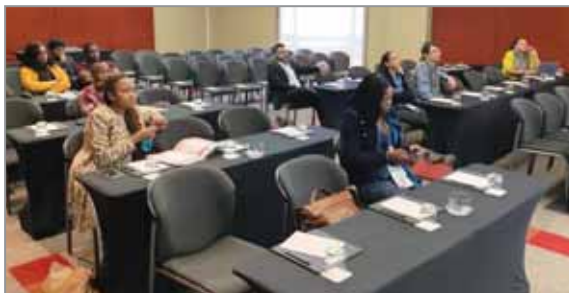
Poor attendance at the session.

At the SA Heart® Congress in 2019, there was an opportunity for these emerging leaders to showcase the work they were involved in as well as their future visions. Regrettably this session (The CVD Imbizo) followed on immediately after our amazing World Cup win over England and attendance at the session was therefore dismal.