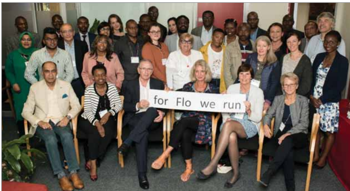
Symposium participants 2019 show solidarity for a young woman who died due to PPCM.