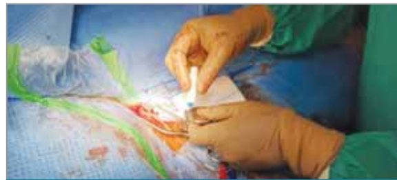
First permanent pacemaker implant at NMAH.