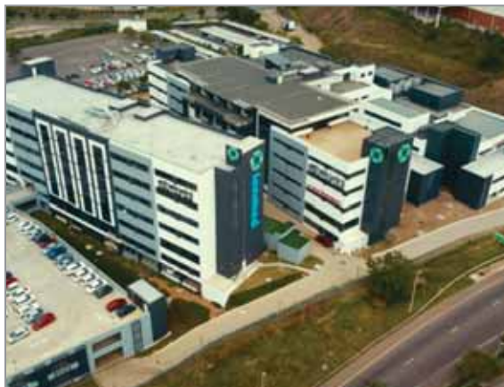
Lenmed Ethekweni Hospital and Heart Centre Durban.