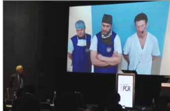
SASCI VPP 2018 AfricaPCR.