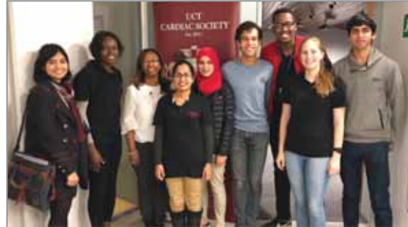
Queen of hearts series

It would be very interesting to see what our community will look like in 20 years! This year our congress will reflect on