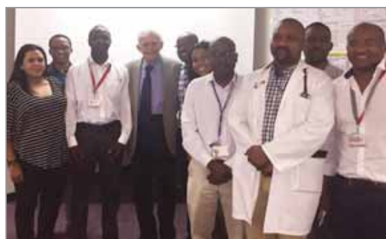
SASCI VPP 2018 GSH lecture last day.

The SASCI Visiting Professor Programme is proudly sponsored by and made possible by our industry partners, Medtronic and Pharma Dynamics .