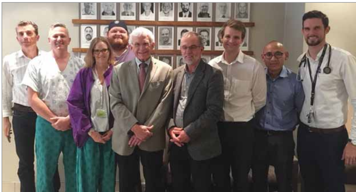
SASCI VPP 2018 Tygerberg Hospital team.