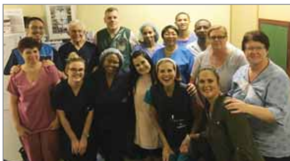
SASCI VPP 2018 Bloem Cath Lab.

“A very real possibility for opportunity.”