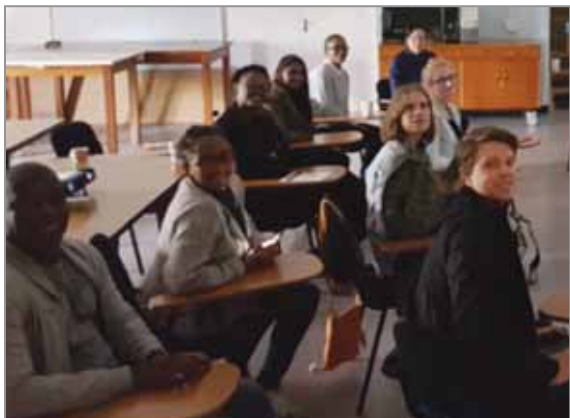
Students attending the theory session.

on the mitochondrial effects that can be expected when the Ataxia Telangiectasia Mutated (ATM) protein kinase expression levels are low. She explored the concept that obesity-induced downregulation of ATM is a primary event in the development of the associated cardiac dysfunction. They previously reported that they had observed such low expression levels in the heart under conditions of high fat feeding in a rat model of diet induced obesity (DIO). Here they reported that the ATM protein is also found within mitochondria with low levels in DIO. Furthermore, it was shown by sequentially shearing off the membranes from mitochondria followed by transmission electron microscopy, confocal microscopy with fluorescently labelled antibodies as well as western blotting, that ATM is localised to the inner mitochondrial membrane. The protein has to be imported into mitochondria as the mitochondrial DNA does not code for it.